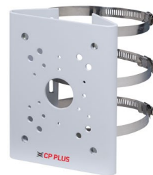
CP-UA-B3P Pole Mount